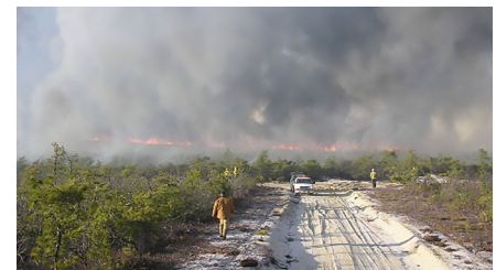
Controlled burns help prevent wildfires, which reduce visibility for air exercises (top and bottom).